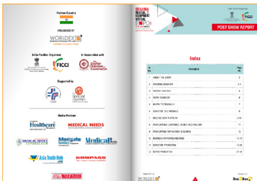
E Show Directory