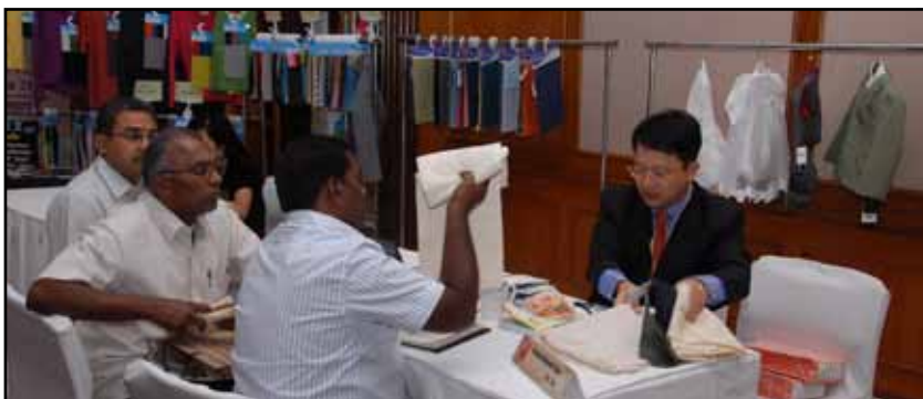
Buyer and Exhibitor interaction at TTF in Bangalore