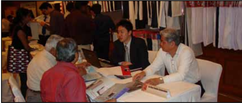
Buyer and Exhibitor interaction at TTF in Bangalore